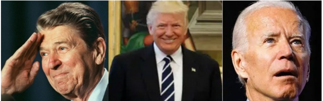
TCCR Staff Screen Shot