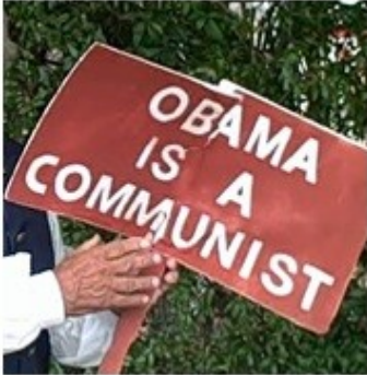
Original 2011 sign

“Trump held on to 99% out of 100 who had voted for Trump before. My last survey was in 2022 during the Biden reign when Trump lost 11% with the same sign. Conclusion: Trump is much stronger. The Memorial Day activities on St. George Street here in St. Augustine, Florida were packed with tourists from all over the country and the world as well. I spoke to two elderly Jewish gentlemen; a German couple in my broken German; a Chinese couple in my broken Mandarin!; a Cherokee Indian in his last years bragging about his moonshine!; and a couple of Vietnam vets who had a moonshine still up in Georgia... Feels good to be back on St. George Street.”