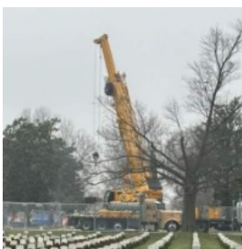
Sunday Morning, December 17, 2023 Arlington National Cemetery

The Plaintiffs are an assemblage of historic preservation groups, including three family members of the Jewish sculptor, Moses Ezekiel, descendants of other veterans around the Memorial and in other areas of Arlington, and two African-Americans who have spoken at Memorial Day observances at the Memorial, including one who was invited to do so in 2023, but whose application was denied by Arlington National Cemetery.