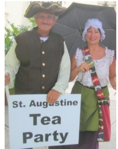
TCCR Staff Photo 2011